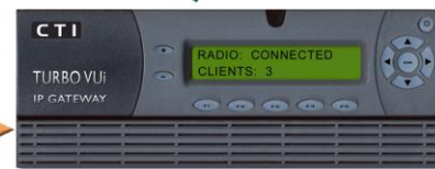
TurboVUI IP Gateway